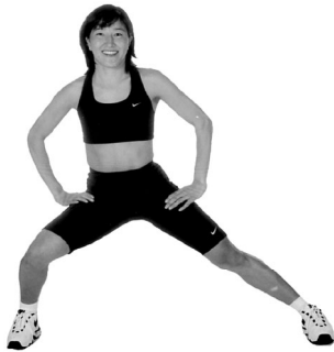
Inner Thigh Stretch