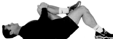
Lower Back/Buttock Stretch