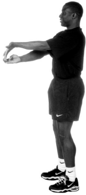
Wrist Extension Stretch