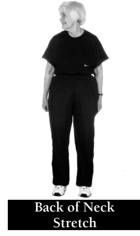
Back of Neck Stretch