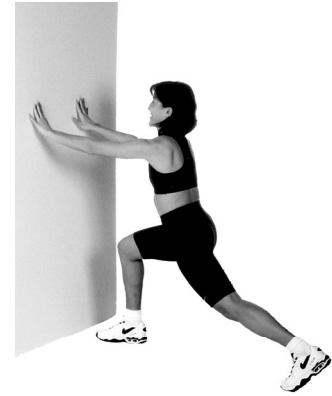
Hip Flexor Stretch