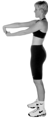
Wrist Flexion Stretch