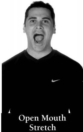
Open Mouth Stretch