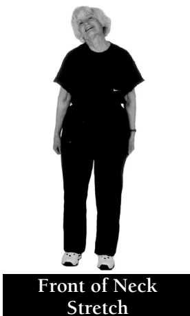
Front of Neck Stretch