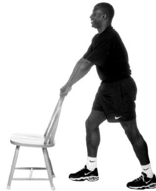
Outer Calf Stretch