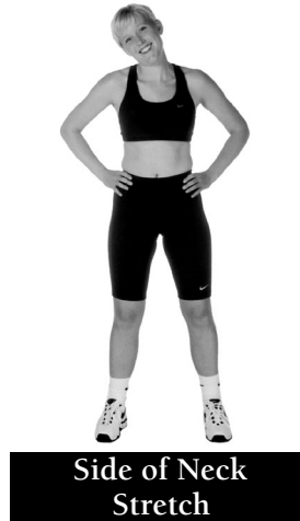
Side of Neck Stretch