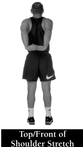
Top/Front of Shoulder Stretch