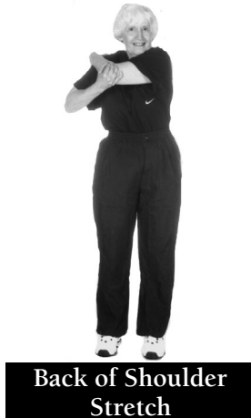
Back of Shoulder Stretch