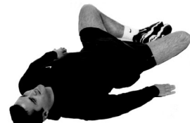
Supine Groin Stretch

“To maintain flexibility, we recommend that all of these stretches be completed during and/or after your activity. The cool-down stretch routine will eliminate lactic acid from your muscles and therefore decrease stiffness and soreness as a result of exercise.”