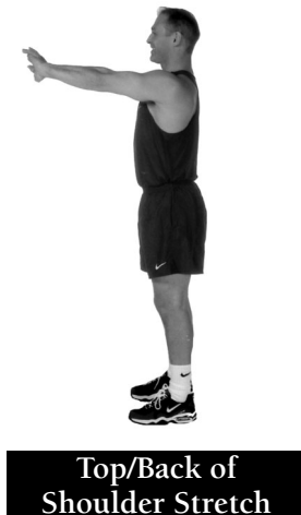
Top/Back of Shoulder Stretch