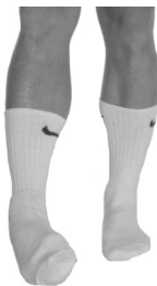
Outer Ankle Stretch