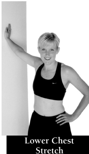
Lower Chest Stretch