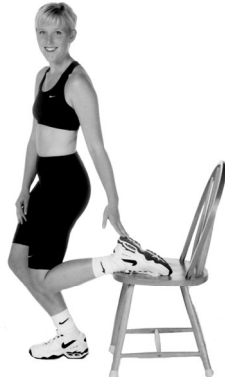
Standing Shin/Ankle Stretch