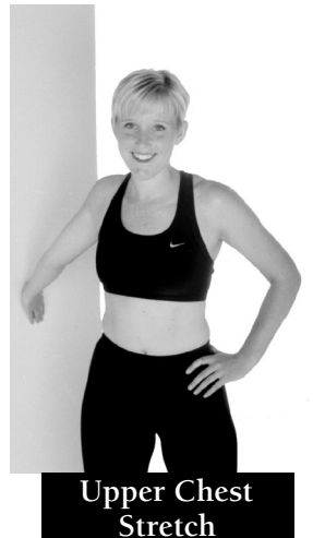
Upper Chest Stretch

Most Common Injuries: Shoulder (rotator cuff) strain; neck stiffness; neck nerve irritation