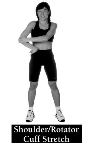
Shoulder/Rotator Cuff Stretch