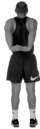
Top/Front of Shoulder Stretch