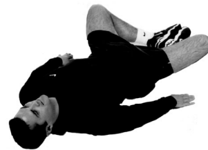
Supine Groin Stretch

“To maintain flexibility, we recommend that all of these stretches be completed during and/or after your activity. The cool-down stretch routine will eliminate lactic acid from your muscles and therefore decrease stiffness and soreness as a result of exercise.”