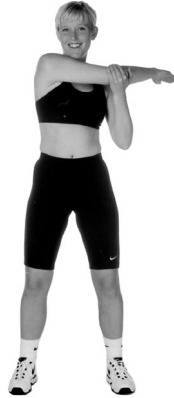
Back of Shoulder Stretch