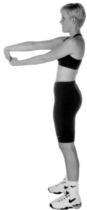
Wrist Flexion Stretch