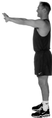
Top/Back of Shoulder Stretch