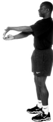
Wrist Extension Stretch