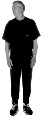
Back of Neck Stretch