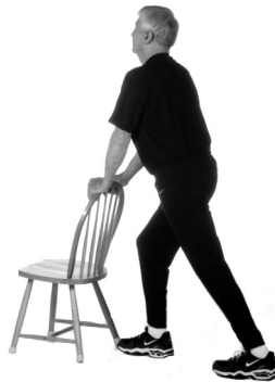
Outer Calf Stretch