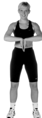
Wrist Flexion Stretch

Most Common Injuries: Low back strain/sprain; herniated disk; shoulder strain; elbow sprain. Golfers elbow is a strain at the wrist flexor muscles as they attach to the bone at the elbow.