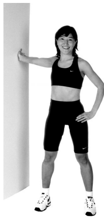
Middle Chest Stretch