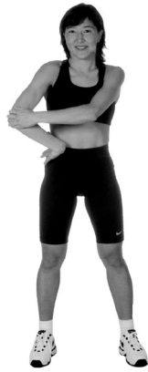
Shoulder/Rotator Cuff Stretch