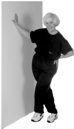
Side of Leg Stretch