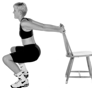
Squatting Chest Stretch