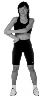
Shoulder/Rotator Cuff Stretch