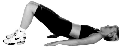
Pelvic Tilt Low Back Stretch