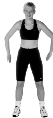
Back of Shoulder/Rotator Cuff Stretch