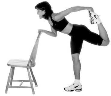
Hip Flexor/Psoas Stretch