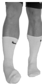
Outer Ankle Stretch