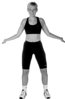
Front of Shoulder Stretch