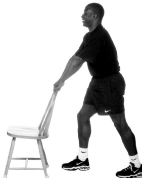
Outer Calf Stretch