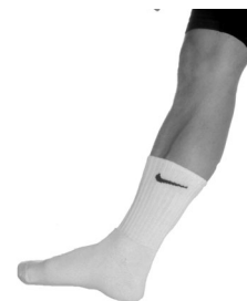
Inner Ankle Stretch

“To maintain flexibility, we recommend that all of these stretches be completed during and/or after your activity. The cool-down stretch routine will eliminate lactic acid from your muscles and therefore decrease stiffness and soreness as a result of exercise.”