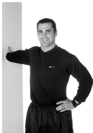
Middle Chest Stretch