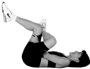
Lower Buttock Stretch