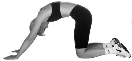
Back Flexion Stretch