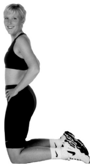
Half-Kneeling Shin Stretch