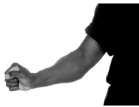
Closed Hand Stretch