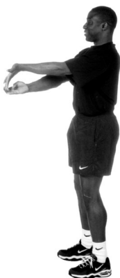
Wrist Extension Stretch