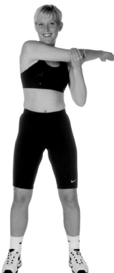
Back of Shoulder Stretch