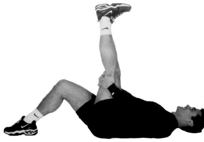
Lying Hamstring Stretch