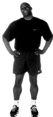
Front of Neck Stretch